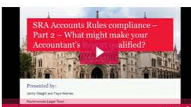
Part 2: SRA Accounts Rules Related videos