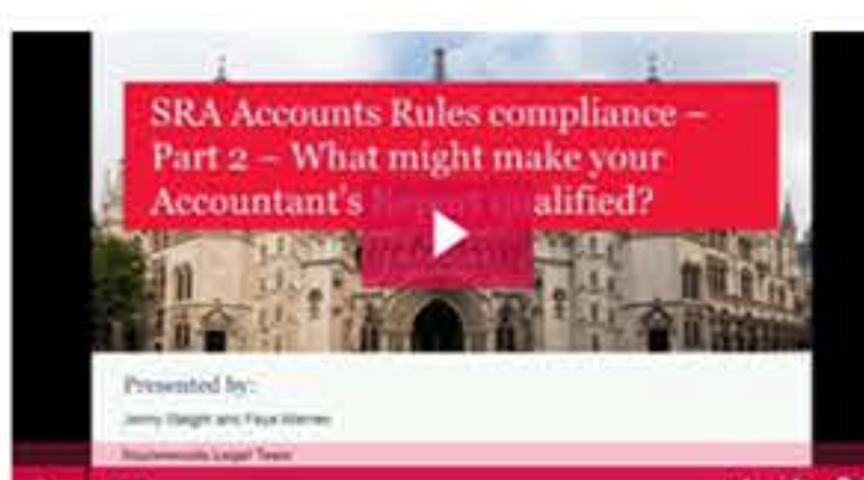
Part 2: SRA Accounts Rules Related videos